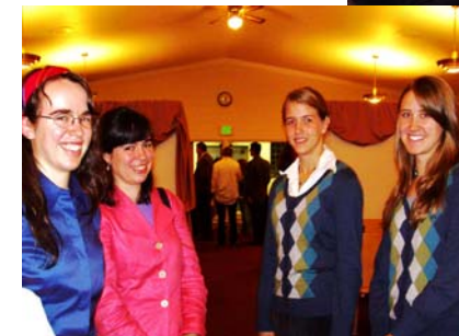
Two alums from Chambers enjoy the Abandoned to God concert

The music style is sacred and classical. Churches have really enjoyed their presentations and testimonies.